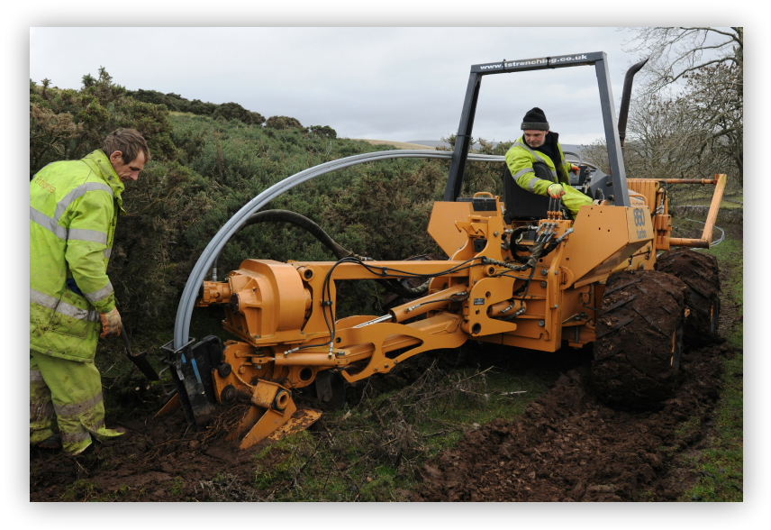
Fiber installation.